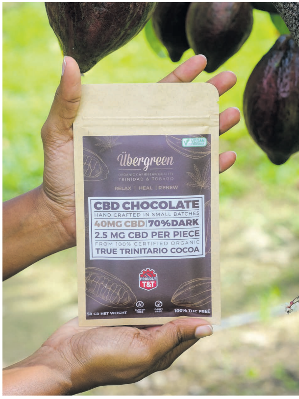
Übergreen Foods Ltd produces CBD chocolate infused with CBD oil made from THC-free hemp

https://eurochamtt.org/ sustainability-championawards-2023/