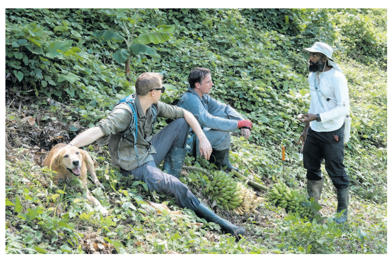
Übergreen is one of the founders of the Original Trinitario Cocoa (OTC) Education Foundation, a registered not-for-profit entity, which offers training and a network to support the development and internationalisation of the local cocoa sector.

For example, House of Angostura supported the construction of three cocoa nurseries which simultaneously serve as youth and farmer training centres. As a result of the project, Übergreen and other cluster members founded