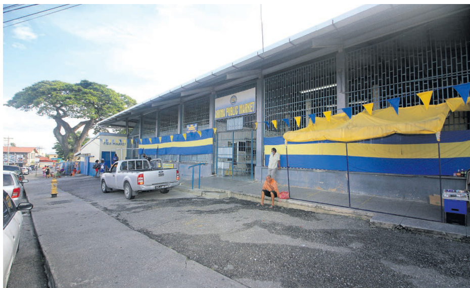
The Arima Public Market will be upgraded to include artisan vendors.