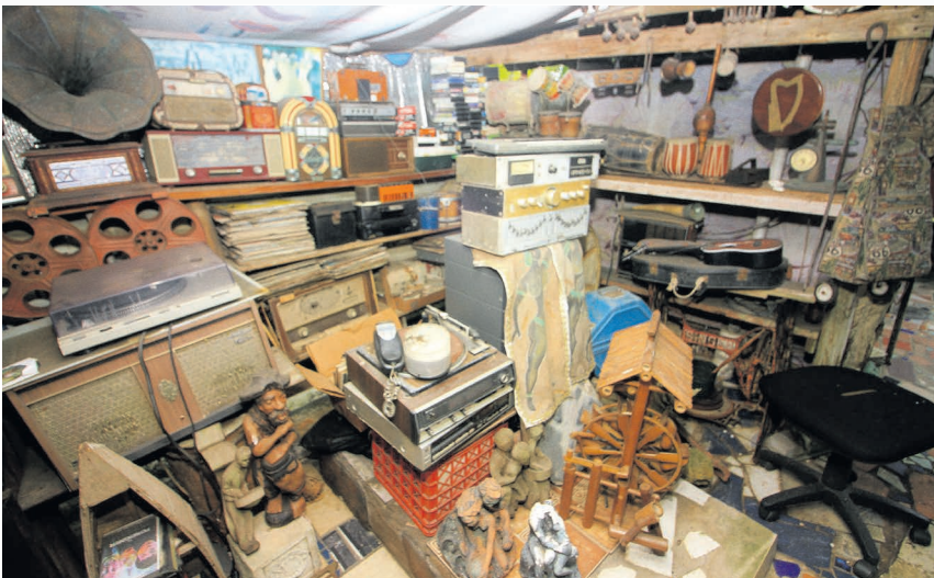
Longtime musical instruments, radios and record players at the Toute Bhagai museum in Santa Rosa Heights.