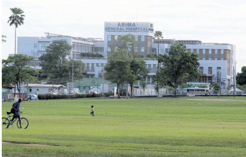
A view of the Arima General Hospital from Princess Royal Park.

The Arima General Hospital was opened in June 2020 and was first used during the covid19 pandemic, as the number of patients requiring hospitalisation grew. The hospital, situated on Providence Circular, overlooks Princess Royal Park to the east and