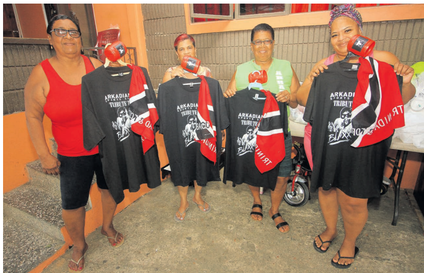
Members of Arkadians Sports Club show the T-shirts maqueraders would wear on Borough Day.