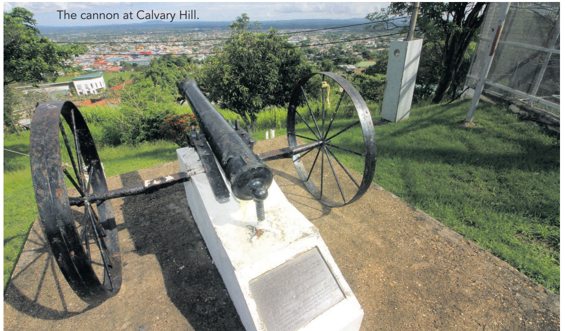
The cannon at Calvary Hill.

cy/dispensary, accident and emergency, radiology, obstetrics, physiotherapy, psychiatry, orthopaedics/burns, optical, ENT, gynaecology and surgery. It serves not only Arima but all its environs including D'Abadie, La Horquetta, Malabar and Arouca.