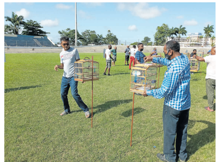
Birds are placed on poles to compete in the brown bird category at Arima Bird Fest held last Sunday at the Arima Velodrome.

Buying a bullfinch from an owner with a track record of winning at these competitions can cost you about $40,000. The average bird owner in the borough has about five of these feathered friends, though some own as many as 20.