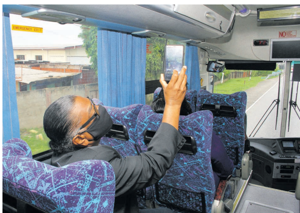
Arima Mayor, Cagney Casimire, rides the newly launched PTSC Coach service from PTSC Terminal in Arima to City Gate in Port of Spain.