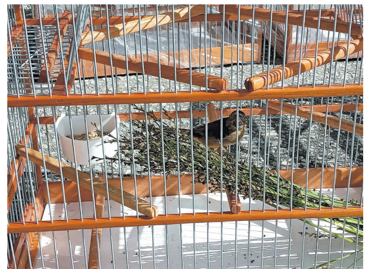
A bullfinch at Arima Bird Fest.