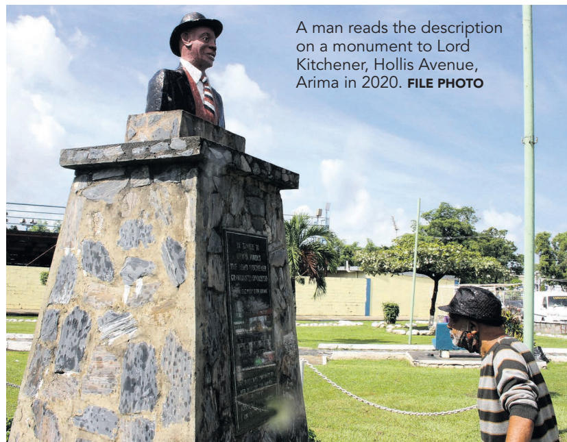
A man reads the description on a monument to Lord Kitchener, Hollis Avenue, Arima in 2020.

He said, "It is a great honour to see that 22 years after his death, people are still preserving the memory and legacy by renaming a prominent street after him. The family feels honoured and grateful. It's nice to see what he gave in the form of culture and the arts is still being rewarded. "He grew up in Arima in the early days, and that's where the heart is.