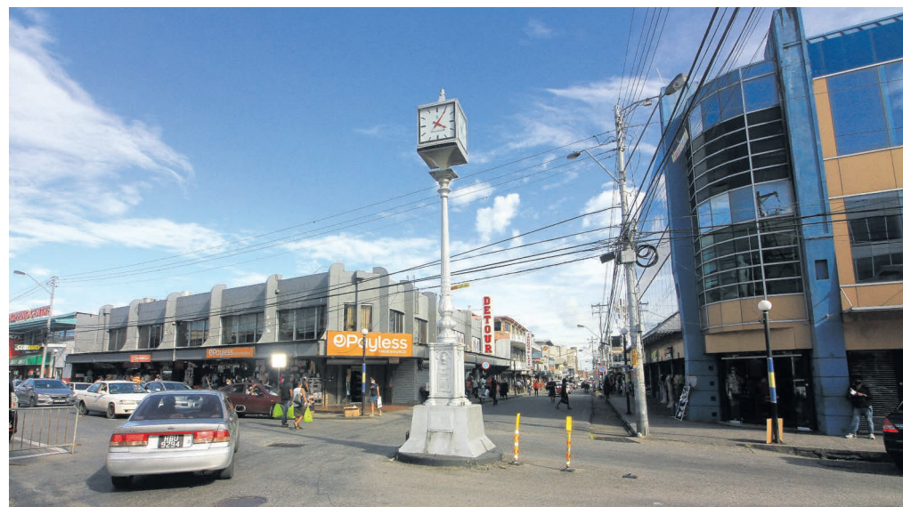
The landmark Arima Dial in the central business district of the borough.