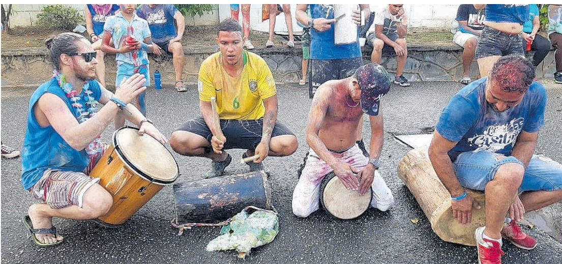
The Herencia Venezolana drum group will participate in the parade of bands for the 134th anniversary of the Arima Borough Corporation.

The Venezuelan community will support the celebrations of the 134th anniversary of the Arima Borough Corporation.