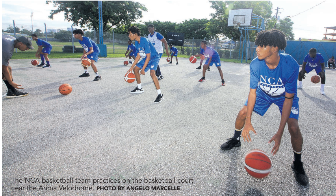
The NCA basketball team practices on the basketball court near the Arima Velodrome.

"At Phase 4, Malabar community, the board that runs it and the Arima Community Centre have agreed to give some of their spaces to set up a