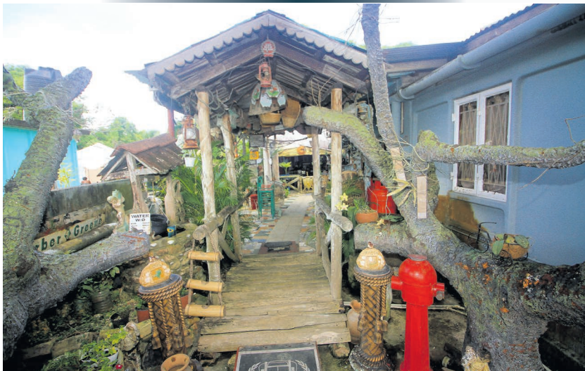
The entrance to the Toute Bhagai museum in Santa Rosa Heights.