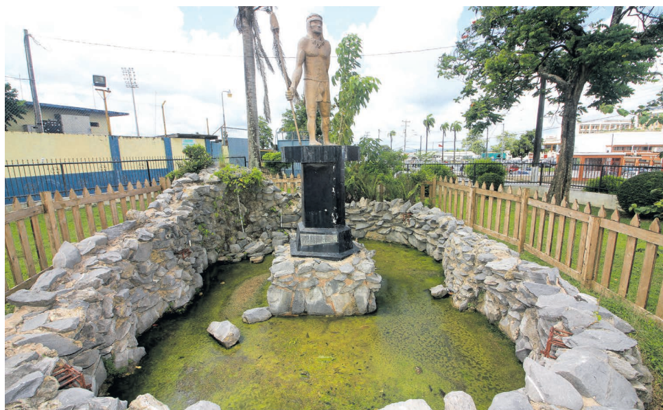
The Hyarima statue located outside the Arima Velodrome.

On October 14, Hyarima is celebrated by the Santa Rosa First Peoples Community with a smoke ceremony, followed by a walk through the borough of Arima. An evening of cultural events will take place on that date.