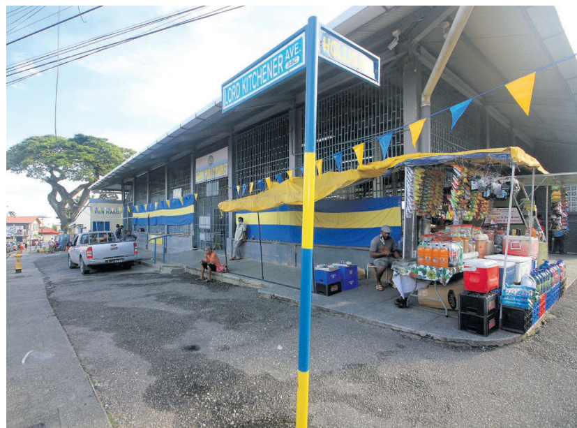
Pro Queen Street was renamed Lord Kitchener Avenue in July.