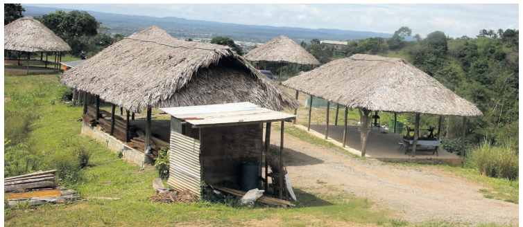
The Santa Rose First Peoples heritage site in Arima.