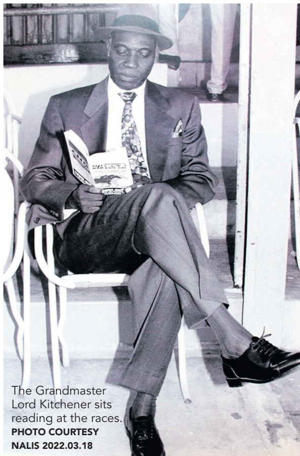
The Grandmaster Lord Kitchener sits reading at the races. 2022.03.18

A ldwyn Roberts, also known as Lord Kitchener or Kitch, was also described as the Grandmaster of calypso.