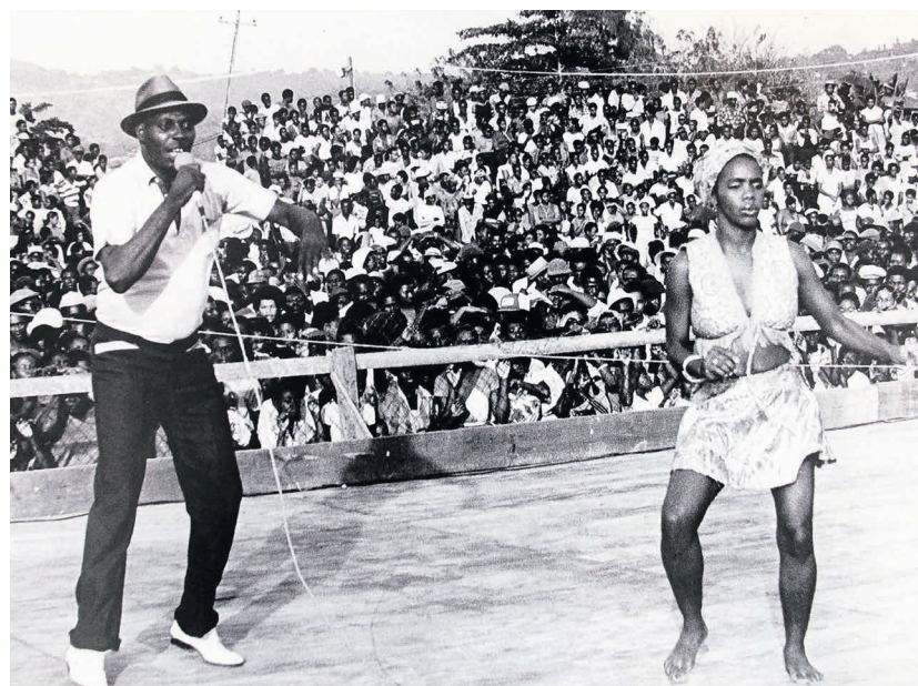
Lord Kitchener entertains the crowd during one of his many performances.

There is also a bust of Kitchener outside the Arima Market.