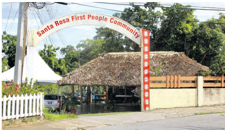
Home of the Santa Rosa First Peoples' Community, Paul Mitchell Street.