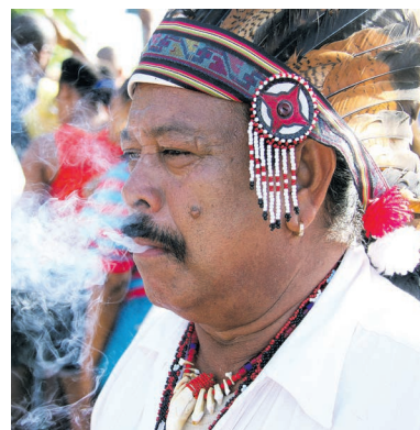
In this 2017 file photo, a member of the First Peoples Community blows smoke at the Hyarima statue during a smoke ceremony held in honour of the first national holiday in honour of their historical importance to TT.