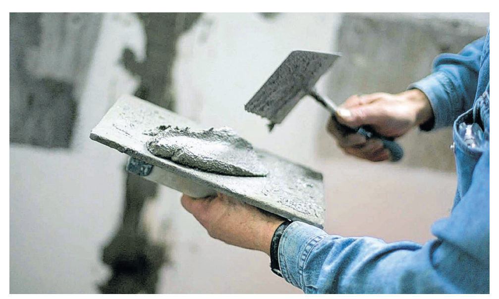
Make sure the plaster has dried completely before painting.

A mist coat is made of watered-down emulsion paint and acts as a primer. The extra moisture gives the wall something to absorb so your topcoat should stick. Alternatively, you can use a water-based primer which saves you the mess of