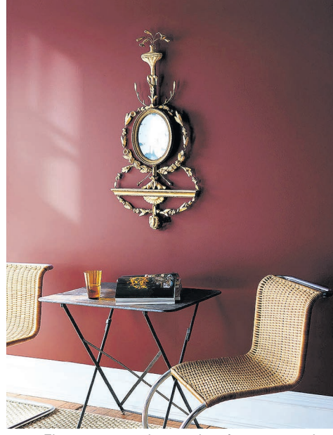
Flat or matte paitn requires fewer coats than gloss finishes and is much easier to touch up.

Flat or matte paint has no sheen and therefore absorbs light. Paints with a flatter finish contain higher levels of pigmentation and has less resin. Among the advantages of using matte finishes are: