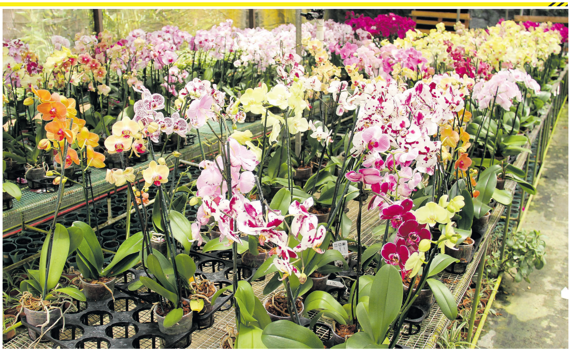
Orchids and other flowering plants can brighten up any space of a homeowner's yard.