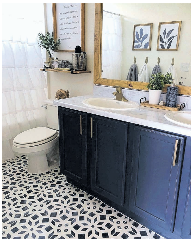
Mare sure you choose the right type of flooring for your bathroom remodel.

So, lay out a firm bathroom design even before you call up the contractor or design company.