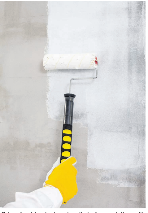
Prime freshly plastered walls before painting with your desired wall colour.

However, you choose to apply the coat, work in smooth upward motions until you cover the entire wall. The mist coat is