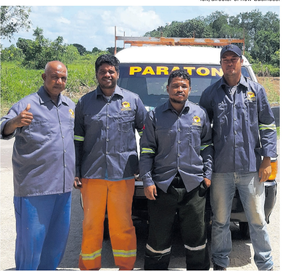
A Paraton Engineering Ltd crew on a job site.