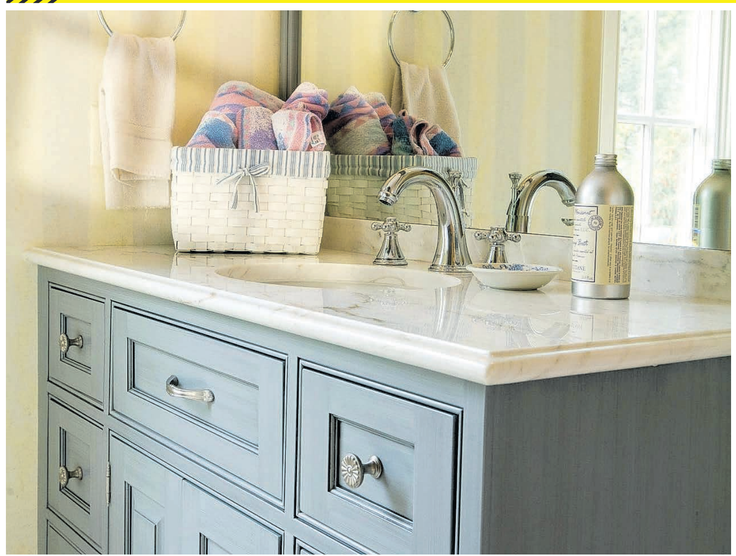
Consider refacing or painting bathroom cabinets instead of replacing them.