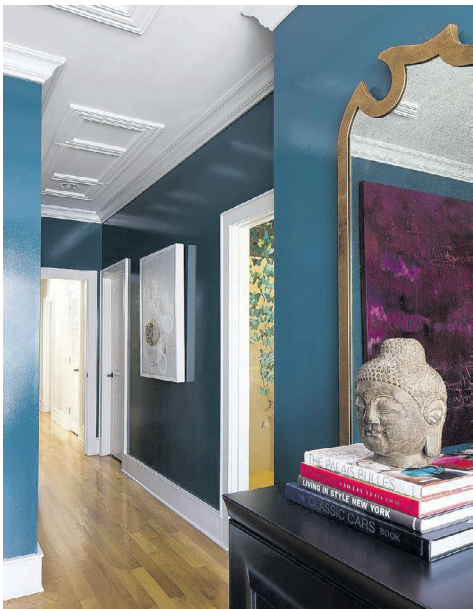
Gloss and semi-gloss paints reflect light and can brighten spaces.