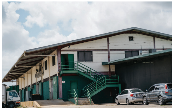
NAMDEVCO Piarco Packinghouse