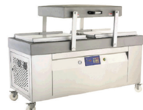
PCDC-640 & PCDC-800